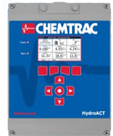
HA2 / HA4